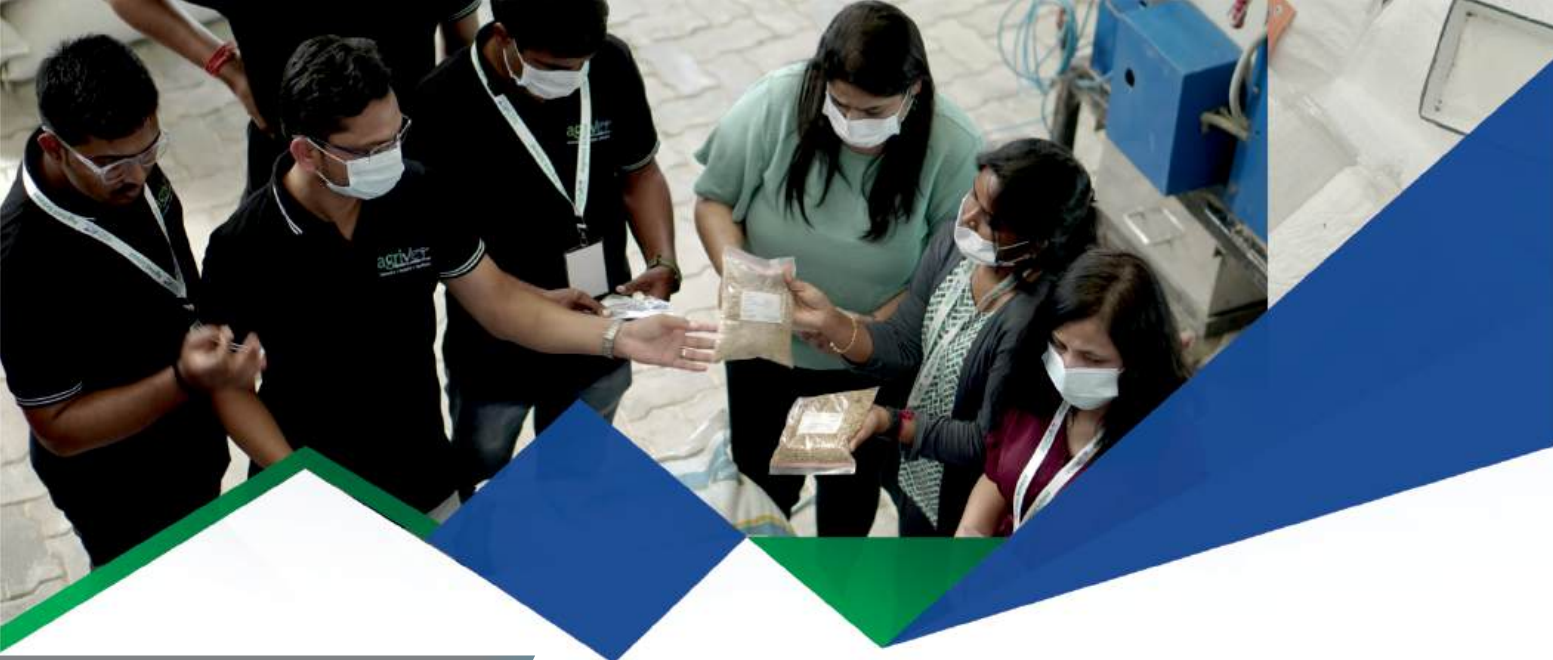
Preparation of Feed Premix - 2D

Feed premixes are formulations of concentrated nutrients and additives that are added to animal feed to ensure balanced nutrition and enhance animal health and productivity. By following scientific approaches and ensuring strict quality control measures, feed manufacturers can produce high-quality premixes that contribute to the health and performance of livestock and poultry. Resources engaged in Feed Production and premix preparation can join this program to understand the basic technology behind feed premix preparation.